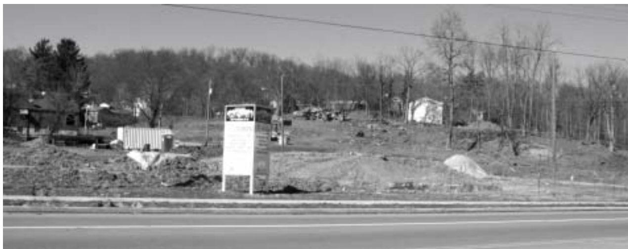
Clearing taking place for Virginia Place, Virginia Avenue just off Colerain