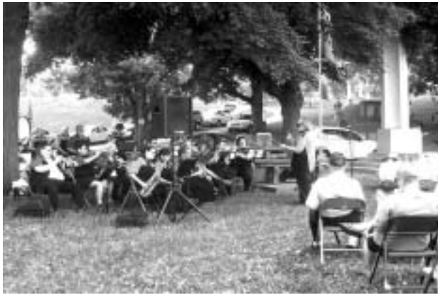
Rainbow Band plays during Memorial Day Service in 2011